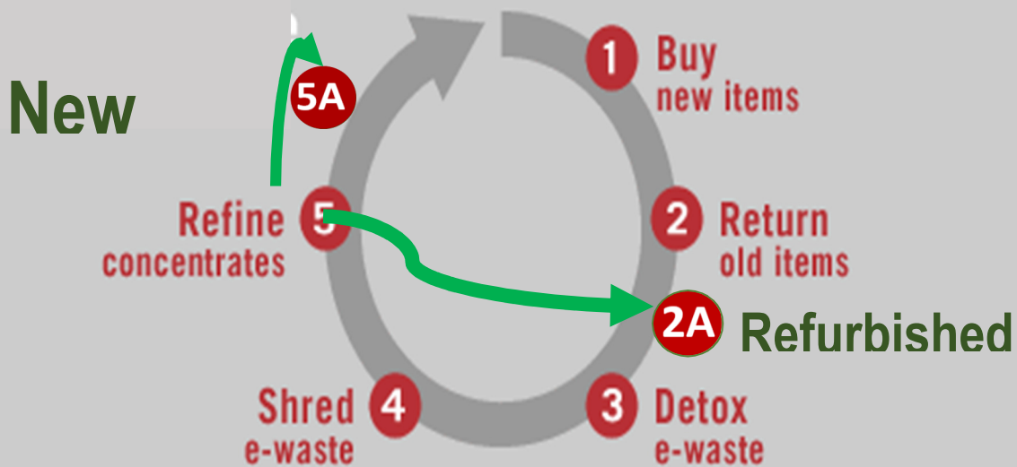
Figure 2: A preliminary self-financing framework for e-waste management. Modified from the e-waste "Wheel of Life"

In the framework we have introduced two new steps, namely 2A and 5A. In 2A returned items in good condition would be considered for refurbishing, possibly using materials recovered in step 5. Refurbished items would be sold in the market at a lower price. Refined materials from step 5 should also be used in designing new products (5A) to the extent possible.