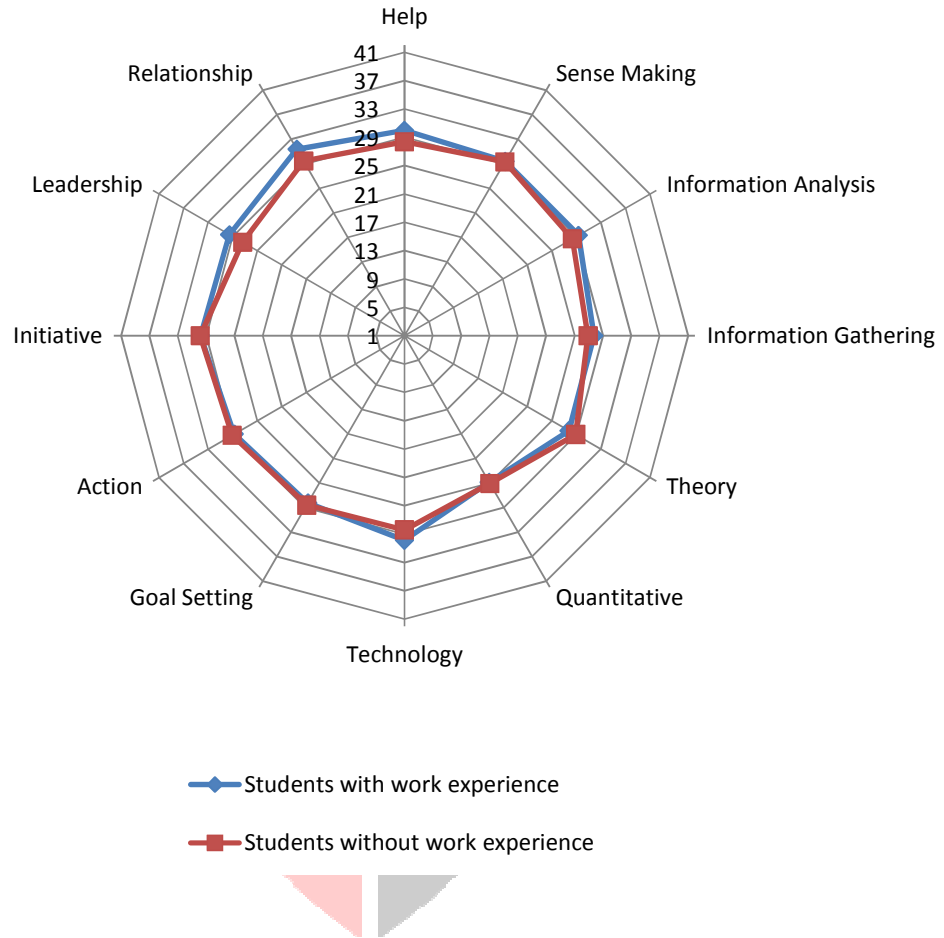
Figure 3- Aggregated learning skills for student owning work experience vs. student without work experience